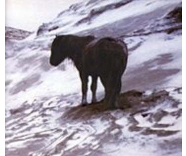
Surviving winter with scarce food - Sable Island

I invite you to take a look at the photography of the horses of Sable Island by Roberto Dutesco . A fashion photographer who learned to see horses in their true light and shares some incredible experiences. (See About Chasing Wild Horses in References below)