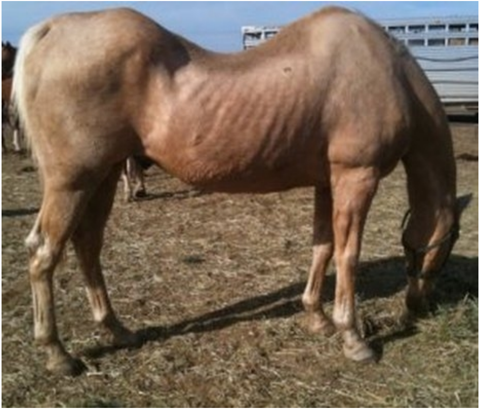
From an ad on Craigslist... 'he is well broke for any level of rider' but needs a new home

A major ingredient in the mix recently is the economy. Horse owners may find other things on which to cut back and bartering has made a little of a comeback. A lot in our world simply requires cash. In the past couple of years people have been forced to give up their horses due to financial strain, loss of jobs and foreclosures on homes. It's a heartbreaking, man-made disaster. People and horses suffer both physically and emotionally.