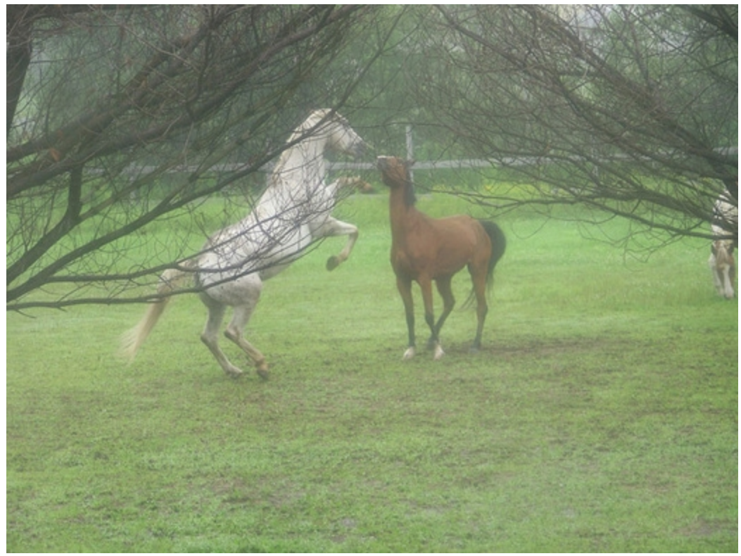
Elements of Nature Within Us All

I know of one place where horses are left alone and that is Sable Island. This thin strip of sand is 300km south-east of Nova Scotia, Canada. It is a 42km (26 miles) long crescent shape by 1km (0.6 miles) wide. There is no public travel to the island and the horses are protected by these restrictions as long as the Coast Guard maintains a station there. Whether protection is maintained or not, rising sea levels will claim most of the island. The horses are free to live and die all on their own. Population goes up and down according to the severity of seasons. Although they are portrayed as displaying typical, textbook herd behaviour, the horses on the small island share space and water and are generally more tolerant with each other in that sense. Mild winters permit the population to increase but many of the old, very young and weak horses do not survive the next harsh winter. Injuries are often not seen, not that it would make