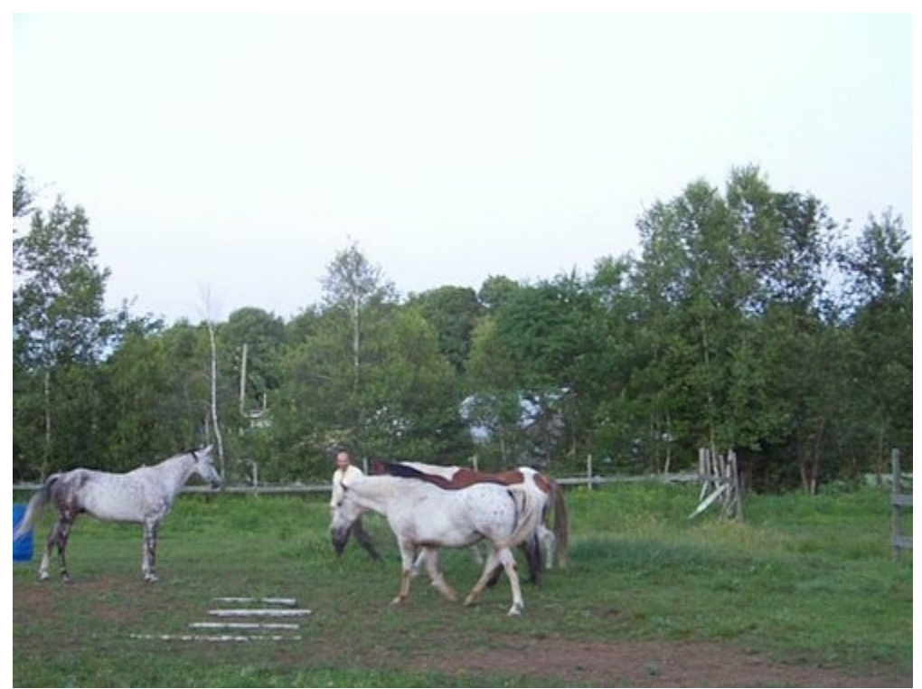
And while I stood there I saw more than I can tell, and I understood more than I saw

It is odd that it has been mentioned to me on occasion on how I interact with my horses is still unjust. While working at liberty, some say that the horses are not really free. True, I only have three acres, but more importantly, I know when a horse says no. It is obvious even in an enclosure that is 100x200 feet (30x61m). More obvious that they can be as free as can be when that enclosure has a 50 foot wide opening (15m).