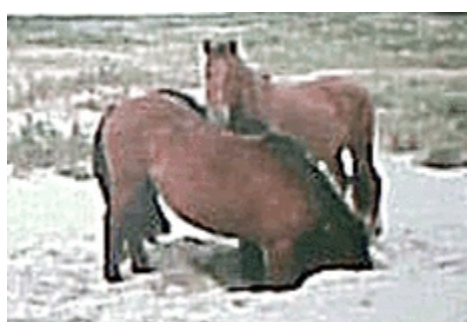
Horses digging for water in dry season - Sable Island

a difference, and horses can linger to suffer, starve and die even during warmer months.